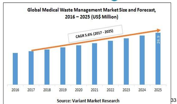
The global medical waste management market

The global medical waste management market was valued at over 10 Bn in 2016 and is expected to expand at the CAGR of above 5% during the forecast period of 2017 to 2025. Increase in incidence and prevalence of infectious and life style diseases, rapidly growing population, rise in healthcare expenditure, and adoption of novel technologies to treat the diseases are the major factors responsible for rise in the generation of According to World medical waste. Organization (WHO), developed regions about 0.5 kg of hazardous waste per hospital bed per day; whereas developing regions generate on average 0.2 kg. Stringent regulations and rising health care costs leading to outsourcing of waste management, initiatives by governments and non-government organizations (NGOs) to manage medical waste, and technological advancements in the methods of waste disposal are the factors expected to drive the medical waste management market growth during the forecast period. However, lack of awareness about proper methods of waste segregation among healthcare workers, and high initial capital investment required to establish a medical waste disposal facility are the factors restraining the medical waste management market.